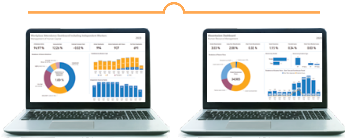
Example views in Microsoft Power BI